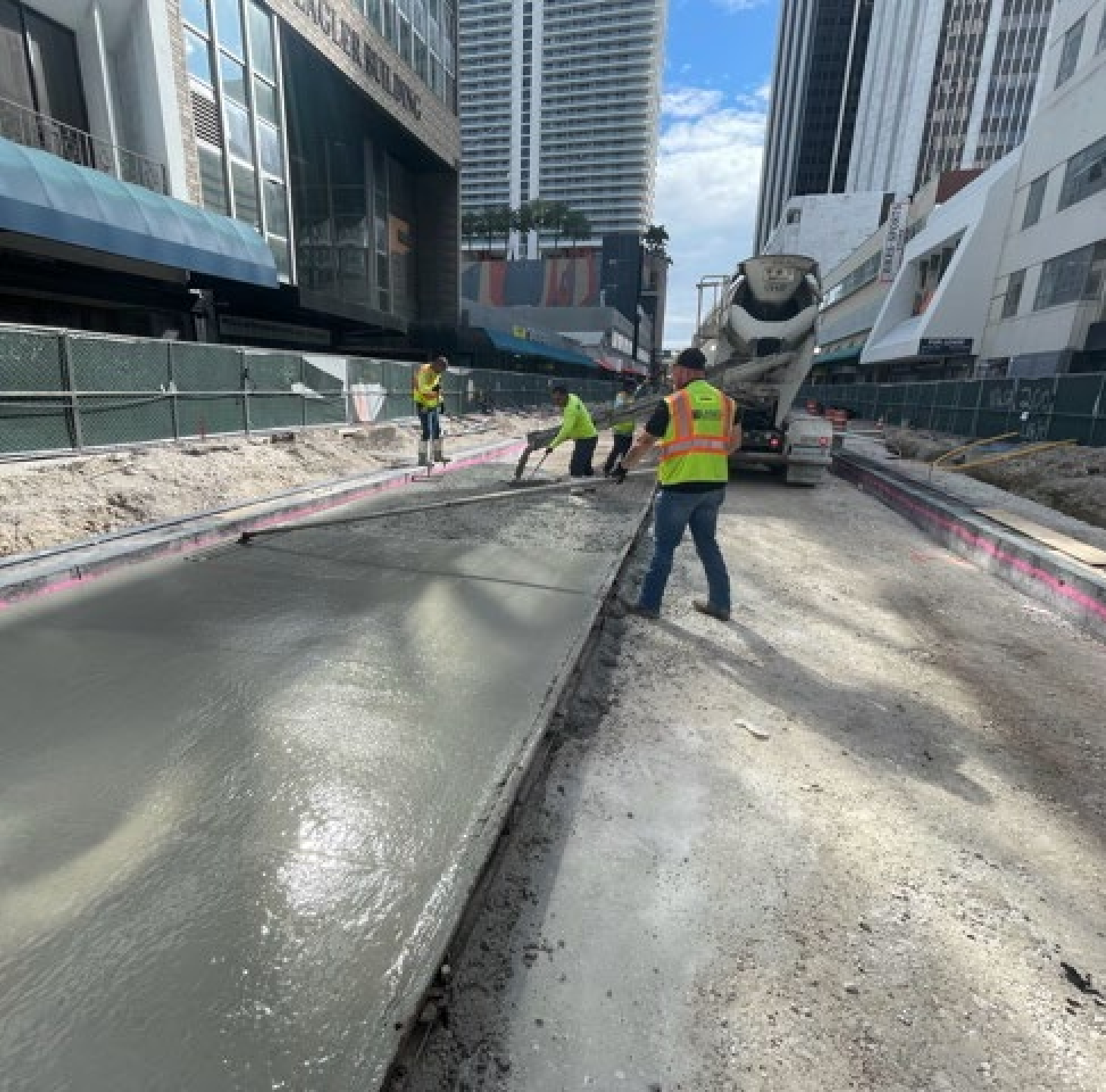
Roadway Concrete Pavement