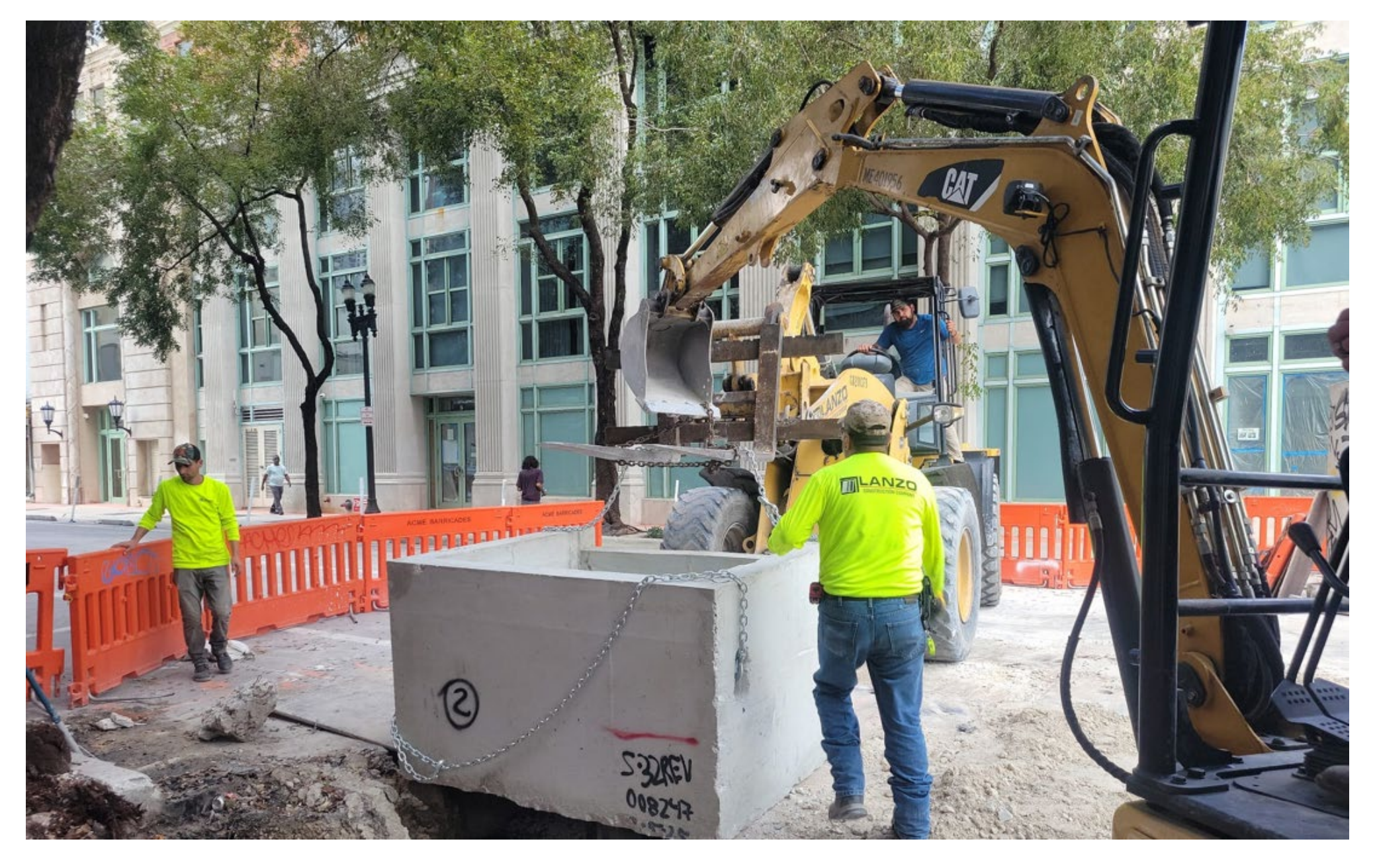
Phase D (E 1<sup>st</sup> Ave to N Miami Ave): Installation of Drainage Structure