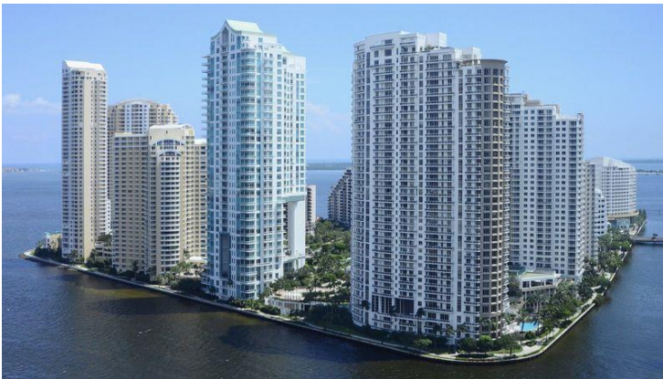
Brickell Key is popular with runners and dog-walkers

Stretching south from the mouth of the Miami river and overlooking Biscayne Bay, Brickell's waterfront location provides a cooling sea breeze to counter its humidity and subtropical temperatures, which average 29C in August. The bayside perimeter path on Brickell Key offers views of the water and is popular with runners and dog-walkers.