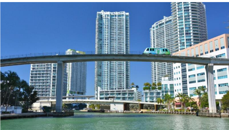
Brickell is part of Miami's Metromover rail

Alternatively, the district is dotted with docking stations for Citi Bike — Miami's bike-sharing service — and is piloting a scooter-sharing scheme.