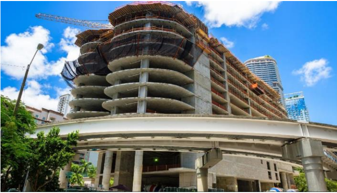
The 64-storey Brickell Flatiron under construction

The 64-storey Brickell Flatiron , going up in the middle of the neighbourhood, is typical in promising upscale amenities such as a rooftop spa and pool, and residents' cinema. Still, Brickell homes offer relative value, with Downtown Miami condos trading at an average $416 per square foot in 2018, compared with $901 in the better-known Miami Beach.