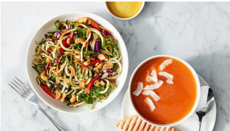
Dr Smood offers organic dining at Brickell City

Brickell City Centre is a $1.05bn mixed-use development that sells itself as the beating heart of Brickell. It has a polished retail offering, including the obligatory Apple store, millennial-friendly eateries such as “organic boutique café” Dr Smood and runs a weekly farmers’ market beneath the nearby Metromover track.