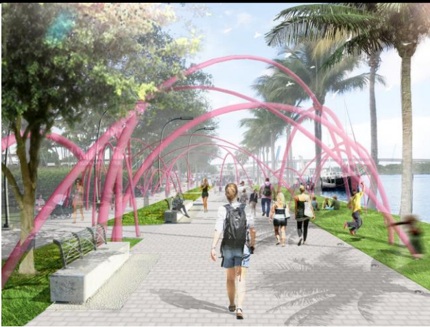
Bayfront Park Promenade