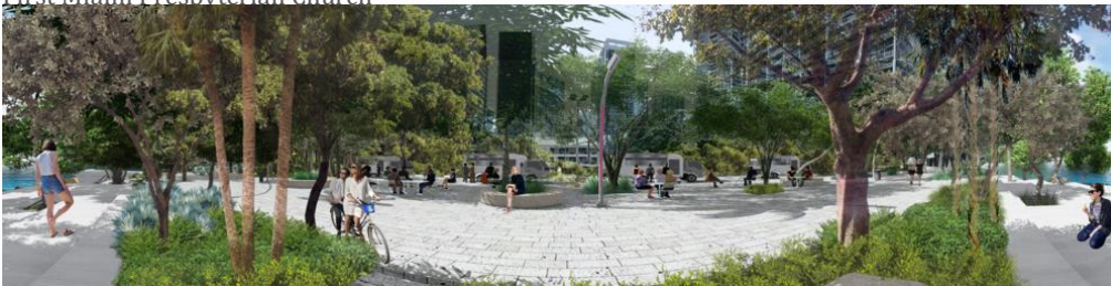
First Miami Presbyterian Church

Renderings via Savino Miller Design Studio