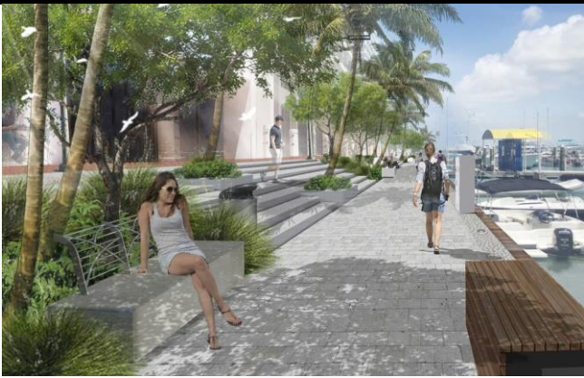
Sea Isle Marina Baywalk