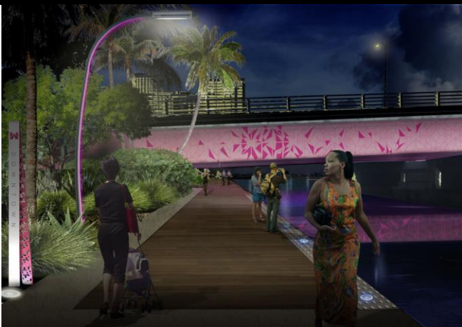
Maurice Ferre Park Baywalk