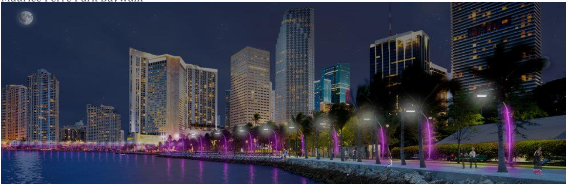
Pink lighting along Bayfront Park