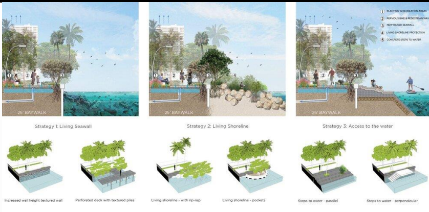
Resiliency plan for Baywalk