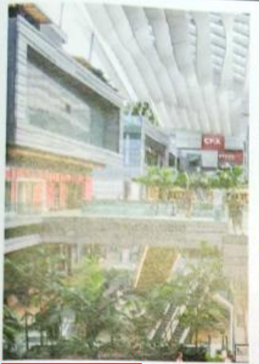
Nightlife at Ocean Drive; in the detail, Brickwell City Centre