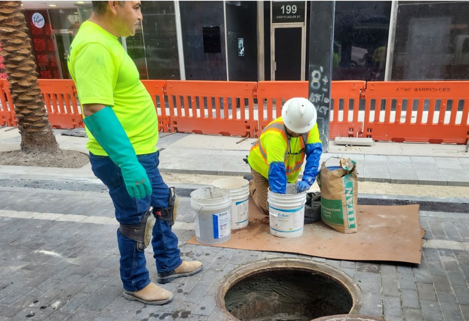
Phase C (E 2 nd Ave to 1 st Ave) Patching inside drainage structure