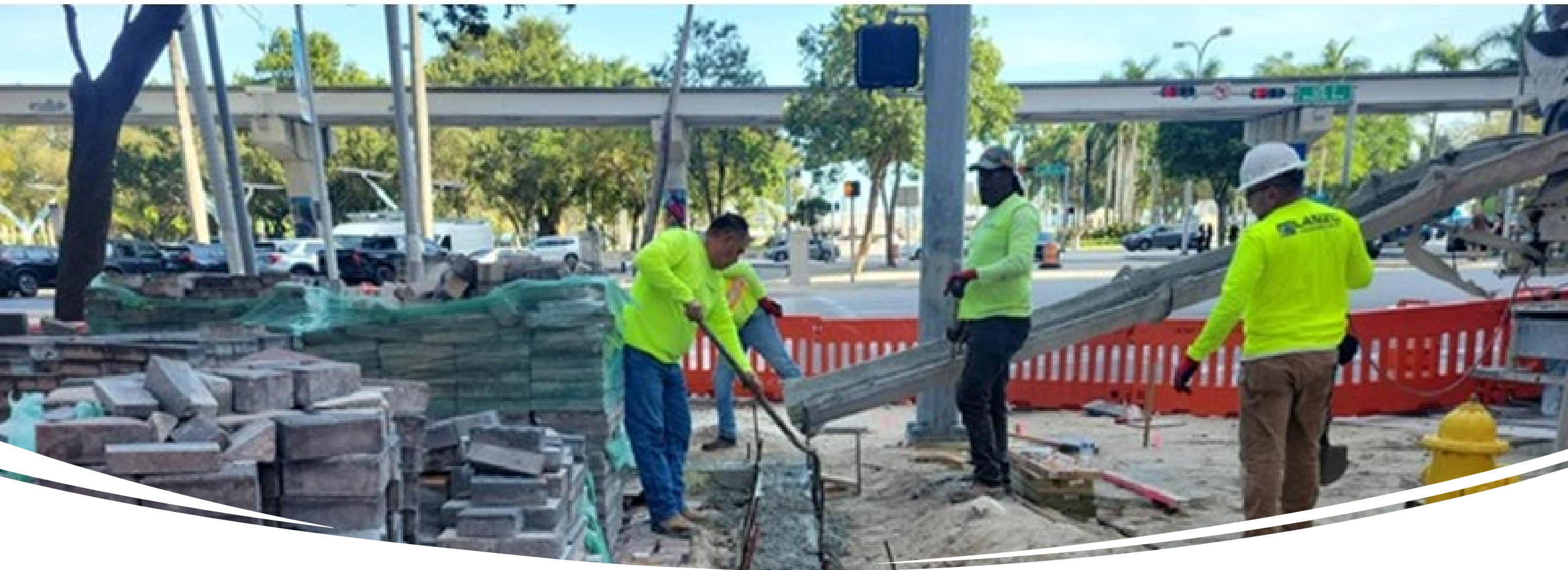
Phase A (Biscayne Blvd to E 3 rd Ave) Foundation concrete pour