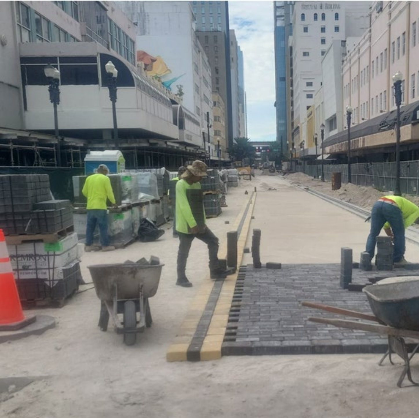
Phase D (E 1 st Ave to N Miami Ave) Installation of roadway pavers