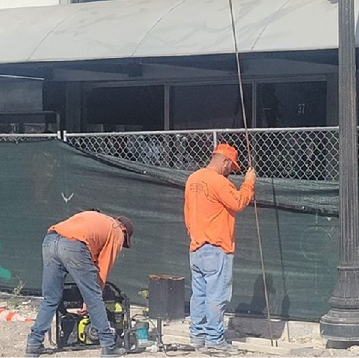
Phase D (E 1 st Ave to N Miami Ave) Installation of ground rods for lighting system