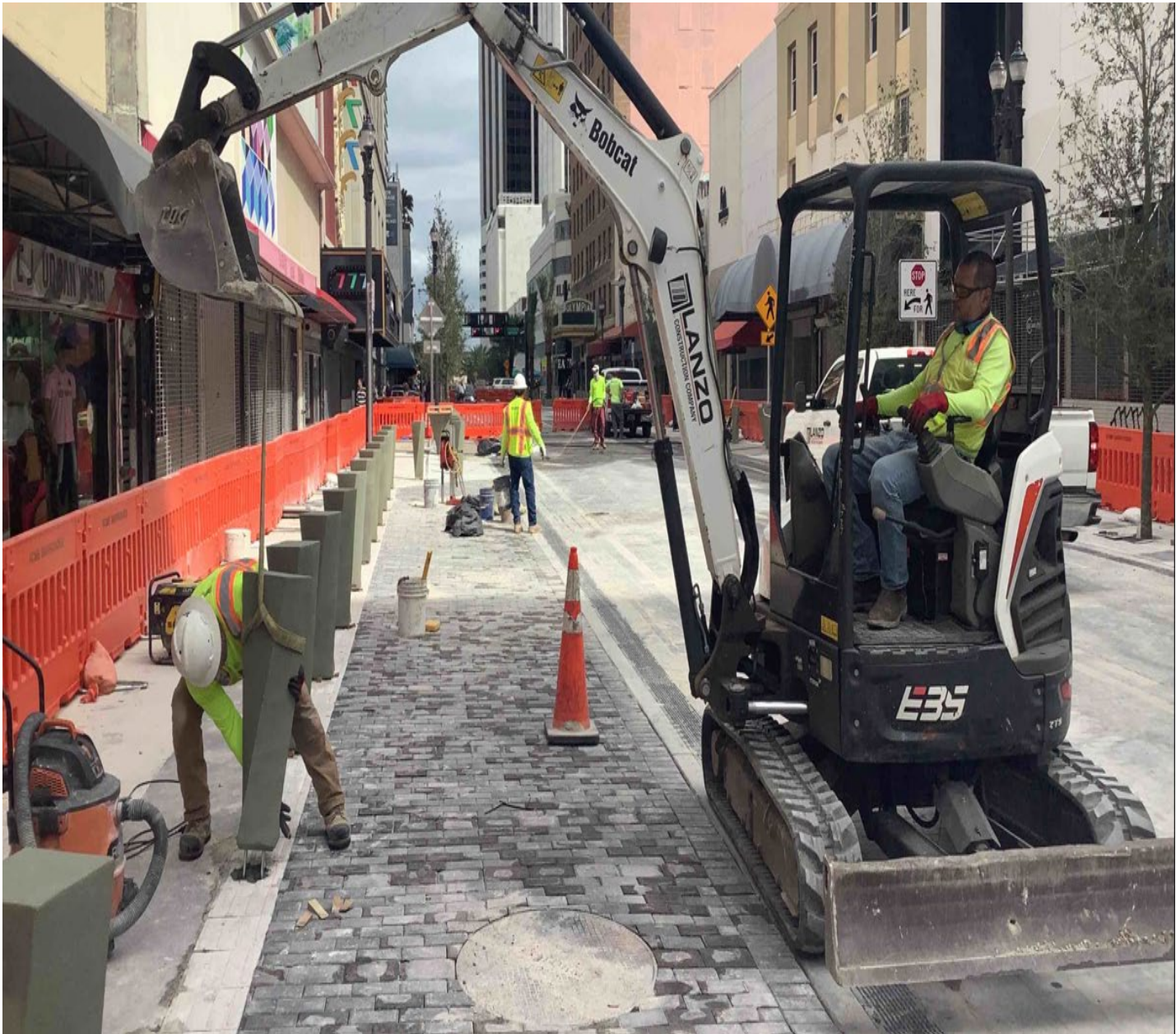
Section C (E 2 nd Ave to E 1 st Ave) • Installed twisted bollards.