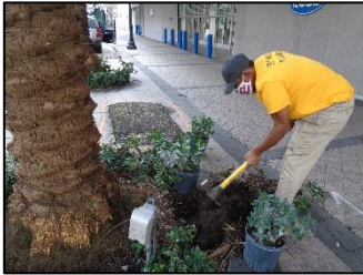
DET/NEAT Landscape Maintenance