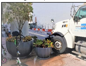
NEAT Watering plants in planters