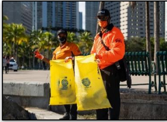
Ambassadors Bayfront Park Clean-up