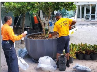
NEAT/DET Installing new plant material