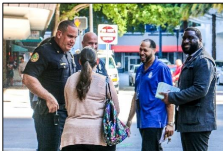
Business Community Outreach Coffee with a Cop CBD – Starbuck's