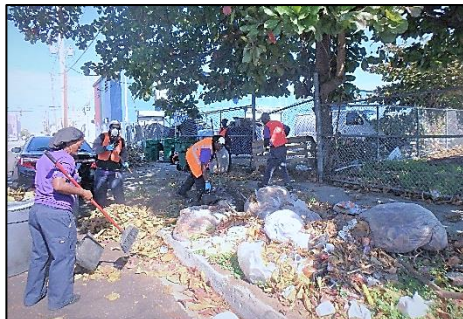
DET/CRA Illegal Dumping Removal