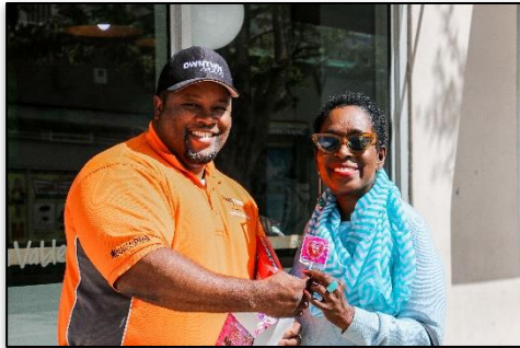
Ambassadors Valentine's Day Candy Distribution