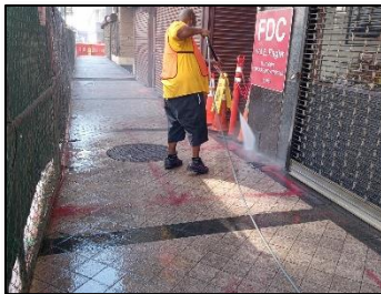
Power Washing Initiative