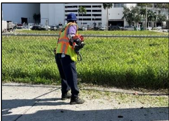
DET CRA ROW Maintenance