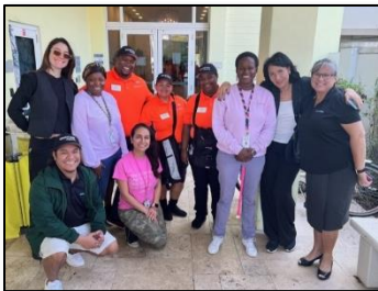
Lotus House Engagement Organization Outreach Tour