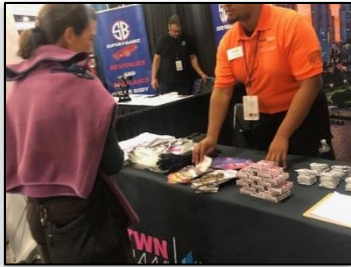
Ambassadors Community Engagement