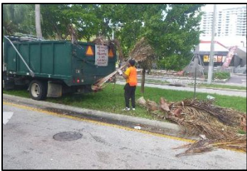
NEAT Palm Fronds Road Maintenance