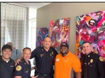
Coffee with a Cop