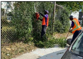
DET CRA Landscape Maintenance