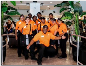
Ambassadors Community Engagement.