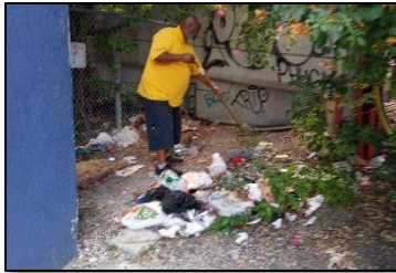
DET Removing Trash from ROW