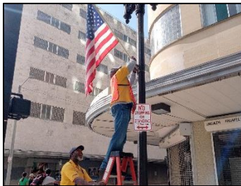
Memorial Day Installation Installed Flags on Flagler Street