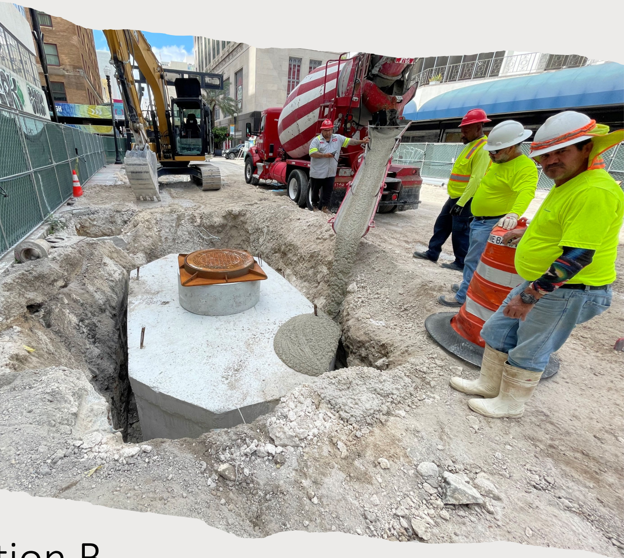
FP&L vault installation Section B